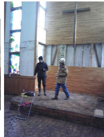
Clean-up inside Shinsei Kamaishi Church in Japan