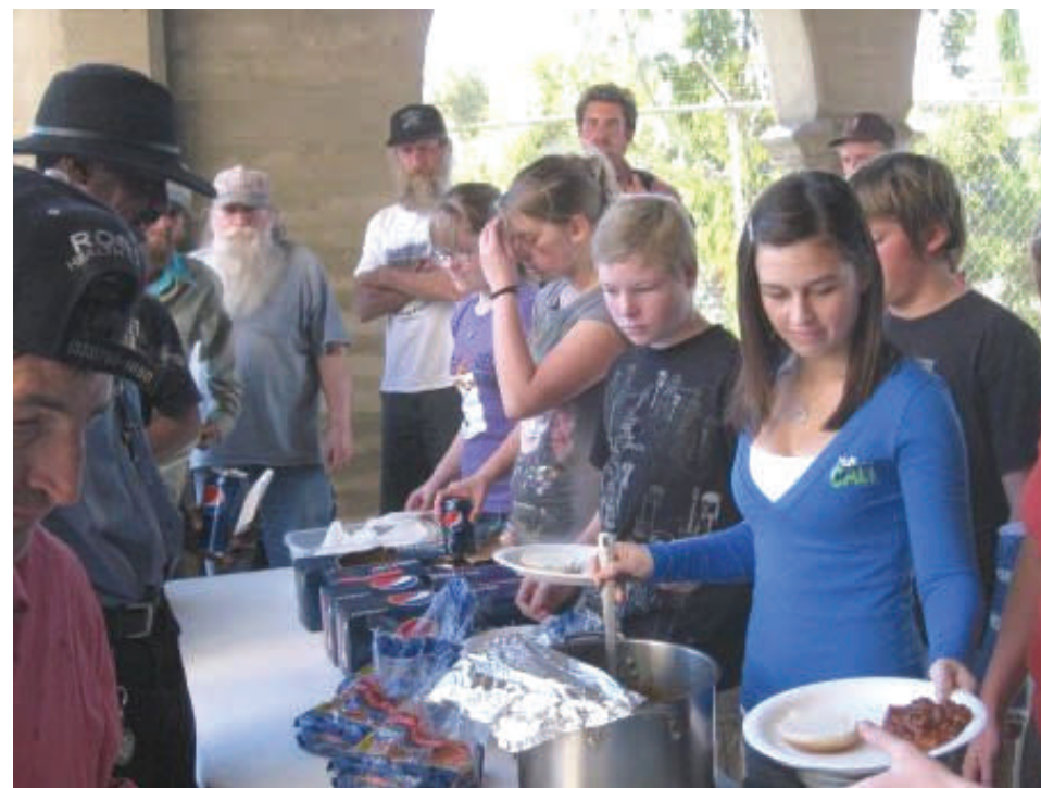
Preparing and Serving at Our Loaves & Fishes Feeding Ministry